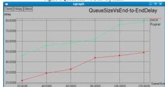
Figure 2. Queue size Vs End to End Delay