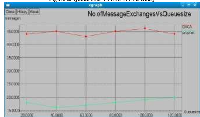
Figure 3. No. of Message Exchanges Vs Queue Size