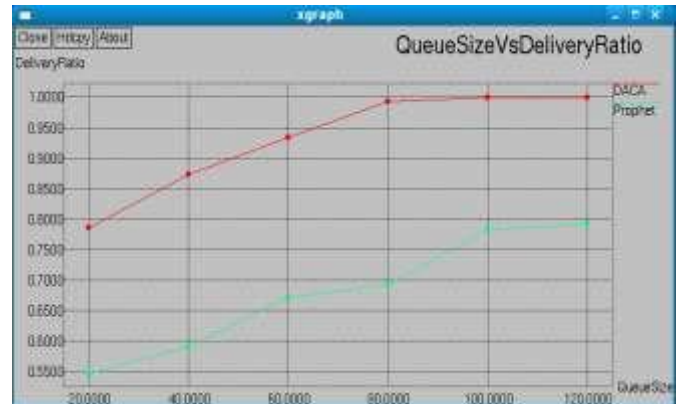
Figure 1.Queue size Vs Delivery Ratio

Figure 4 shows the Message Rate Vs Delivery Ratio. While increasing the message rate the delivery ratio of DACA is higher than the Prophet model.